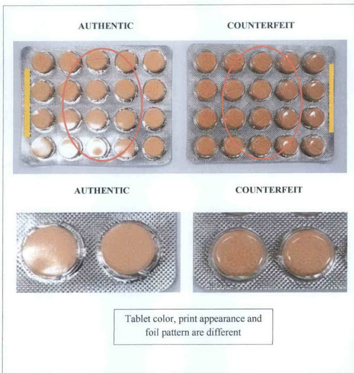
Figure 1. Comparison between the authentic and verified counterfeit/fake Paracetamol (Biogesic) 500 mg tablet

The Food and Drug Administration (FDA) advises the public against the purchase and use of the verified counterfeit drug product Paracetamol (Biogesic) 500 mg Tablet: