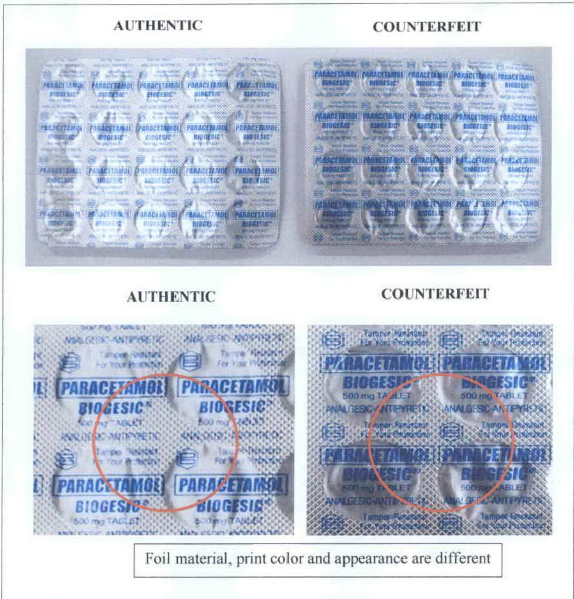
Figure 2. Comparison between the authentic and verified counterfeit/fake Paracetamol (Biogesic) 500 mg tablet