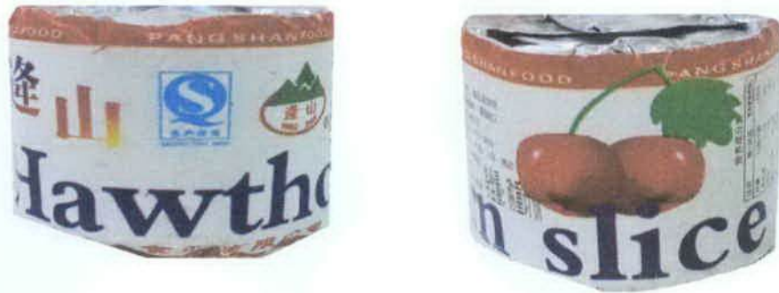
Figure 9. Unregistered Pangshan Food Hawthorn Slice