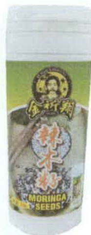
Figure 8. Unregistered Moringa Seeds with Brand and Product Name in Foreign Characters