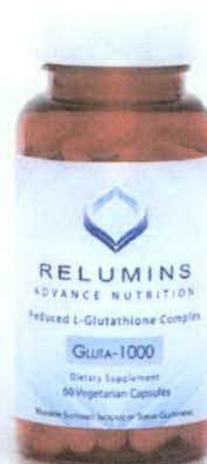
Figure 2. Unregistered Relumins Advance Nutrition Reduced L-Glutathione Complex Gluta-1000