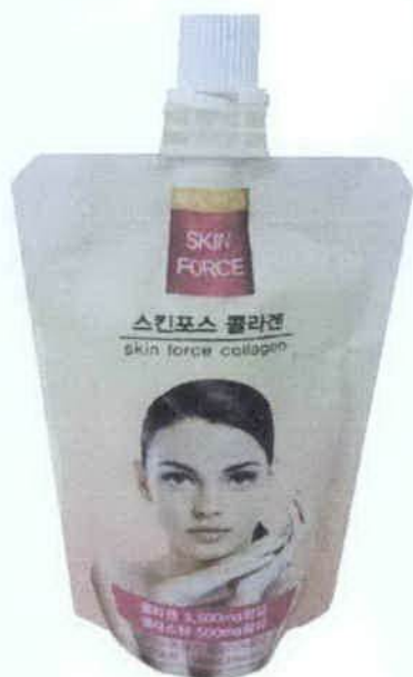
Figure 1. Unregistered Skin Force Collagen

The Food and Drug Administration (FDA) advises the public against the purchase and consumption of the following unregistered food products and food supplements: