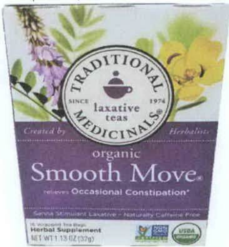
Figure 3. Unregistered Traditional Medicinals Smooth Move