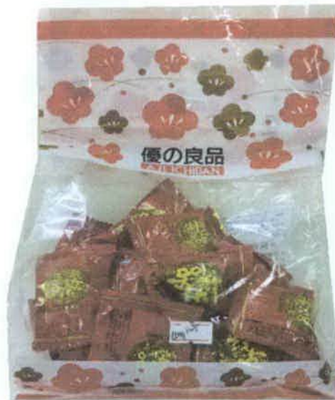
Figure 10. Unregistered Ajlichiban (Dates Seedless) with Brand and Product Name in Foreign Characters

FDA post-marketing surveillance (PMS) activities have verified that the abovementioned food products and food supplements have not gone through the registration process of the agency and have not been issued the proper authorization in the form of Certificate of Product Registration. Pursuant to Republic Act No. 9711, otherwise known as the “Food and Drug Administration Act of 2009”, the manufacture, importation, exportation, sale, offering for sale, distribution, transfer, non-consumer use, promotion, advertising or sponsorship of health products without the proper authorization from FDA is prohibited.