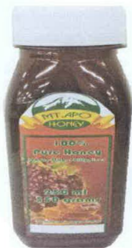
Figure 7. Unregistered Mt. Apo Honey 100% Pure Honey