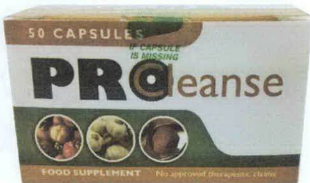
Figure 5. Unregistered Pro Cleanse Food Supplement